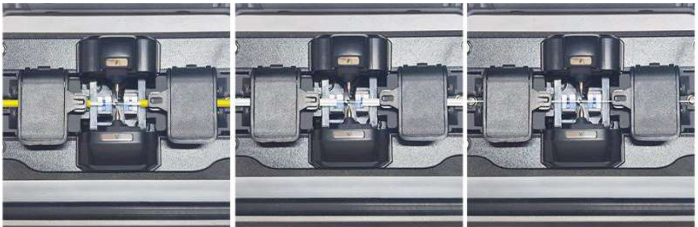
Jumper fiber (pigtail)

SM, MM, bare fiber, pigtail, Drop cable, multi fiber cable